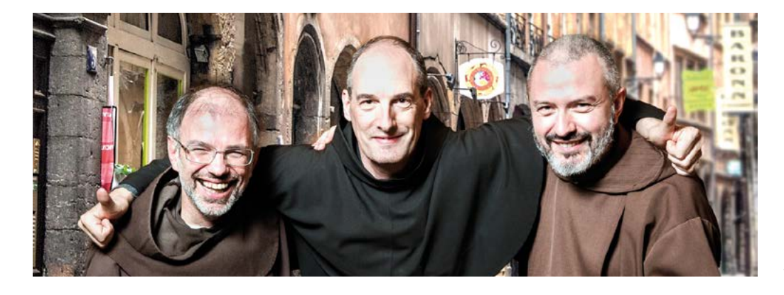
Representatives of the three families

All the news about this mission can be found on Facebook: Fraternels dans la ville (Brothers in the City).