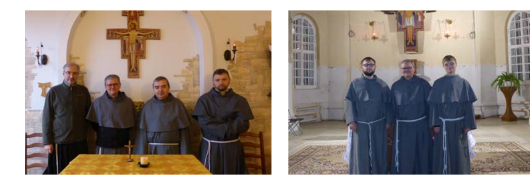
The communities in Czerniakovsk and Astrahan

The canonical visitation will conclude after the Visitator meets with the Custodial Definitory on December 13-14, 2017, in St. Petersburg