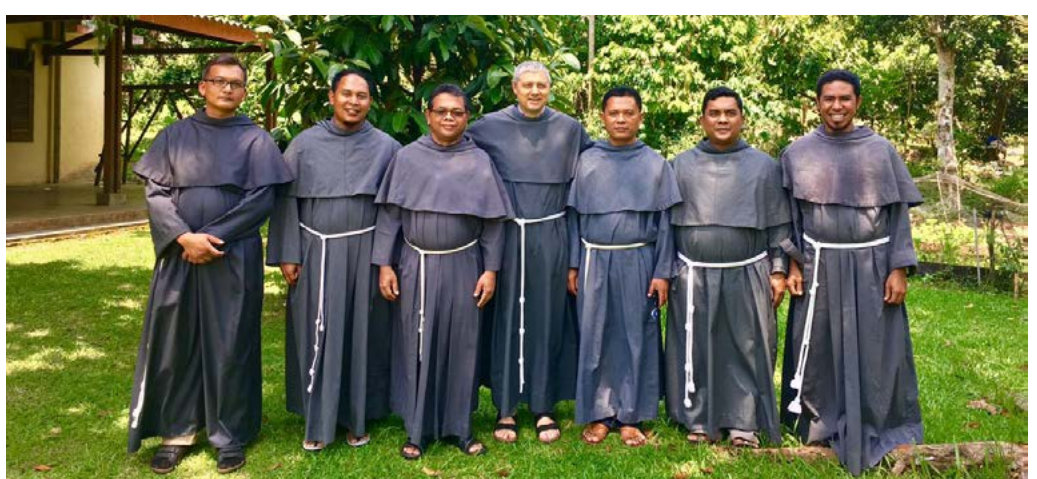
The Definitors with the Minister Provincial

The second session of the Chapter is scheduled for July 31 to August 4, 2017 during which the friars will work on the Custodial Four-Year Plan and will choose the guardians for the communities of the Custody.