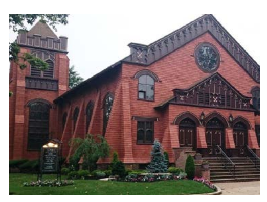
Point Pleasant Beach, community / church and friary