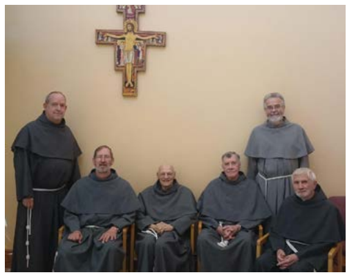
Kensington church / community