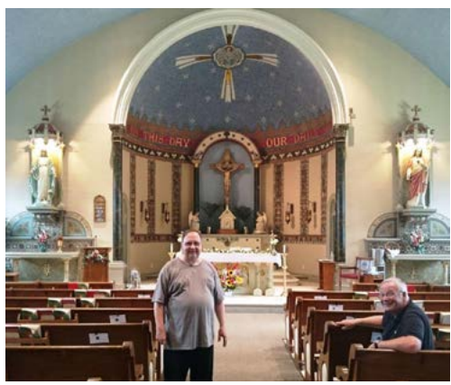
Shamokin church / community