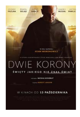
The film's poster

It is hoped the film will soon be seen worldwide.