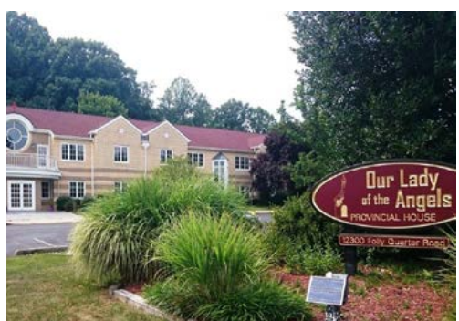
Provincial Definitory / Ellicot City, Provincialate and friary