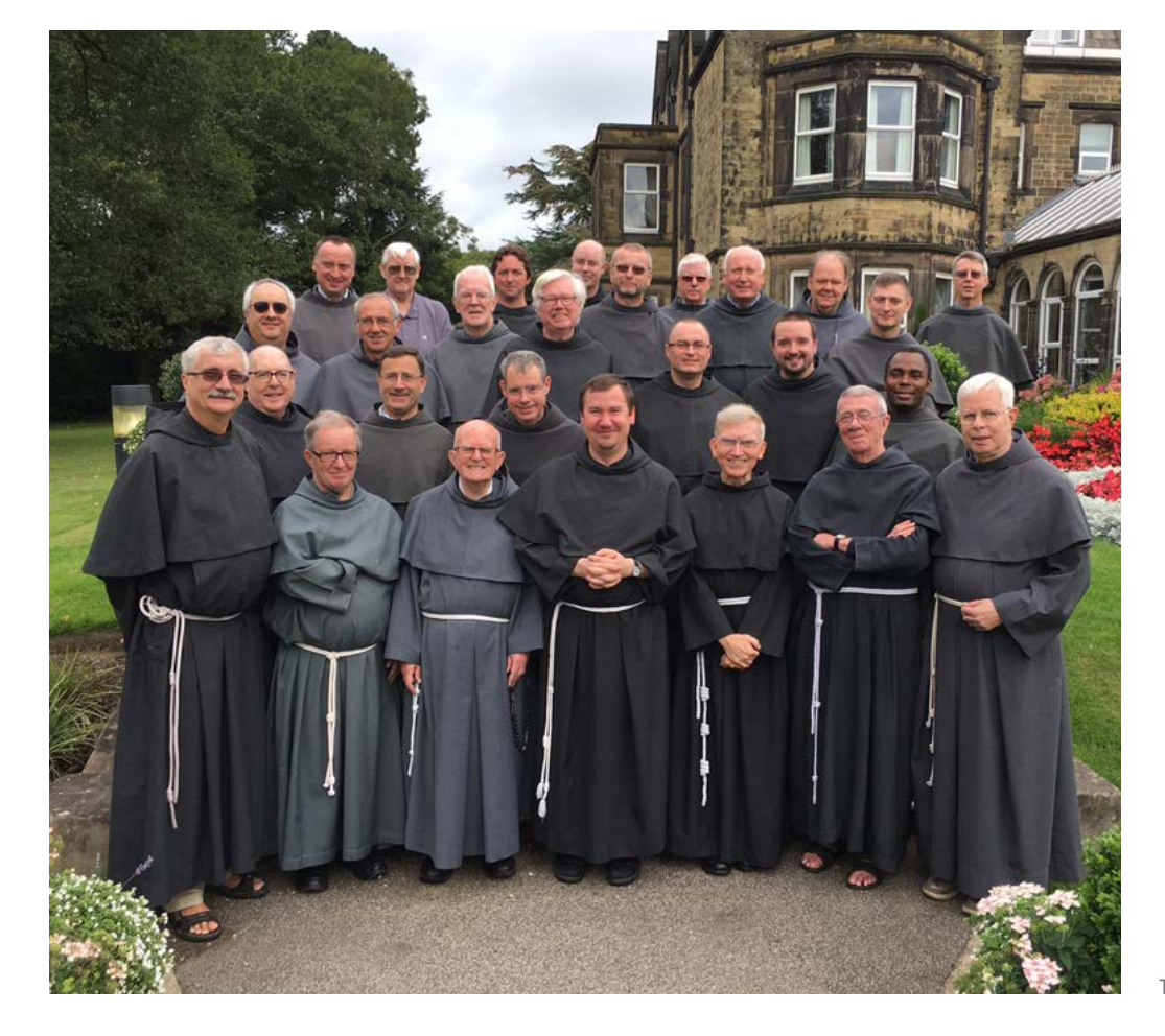
aternus Nuntius 3/2017