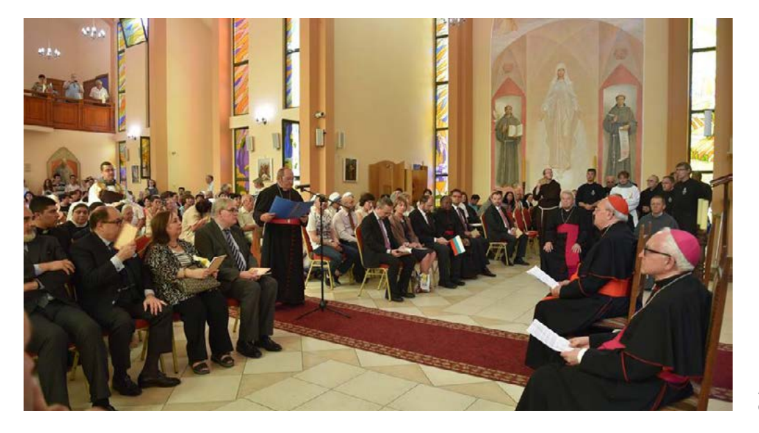
A moment during the festivities

The Minister Provincial thanked the Cardinal for taking part in the celebrations and for the words he addressed to the friars. He presented the Cardinal with an icon of St. Francis of Assisi to commemorate the meeting.