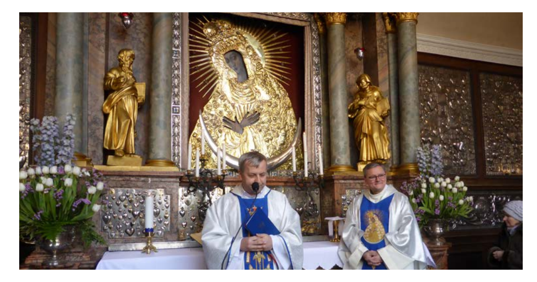
Before the painting of the Madonna

The friars were able to learn about the progress being made on the construction of the new friary in Klaipėda. It should be finished before summer of this year. During the meeting, the friars discussed some changes to the Statute of the Delegation, made some plans for the year, establishing the dates of the fraternal meetings and days of the Community spiritual retreat. They also exchanged some opinions about their future work in youth and vocational ministry. All the friars of Lithuania are expecting the Order to return to its historic friary in Vilnius. This could be a source of new growth for the life and pastoral activity of the Delegation as well as the Vilnius community.