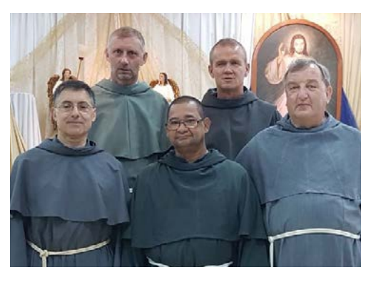
The guardians of the Delegation / the Shushufindi community