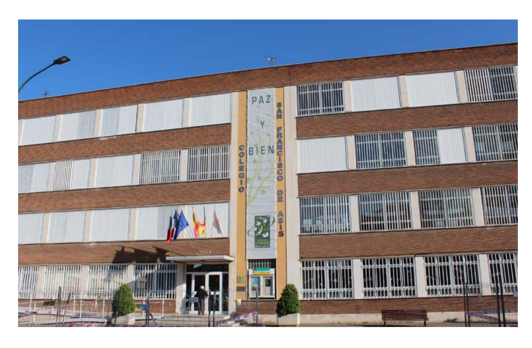
San Francisco de Asís College