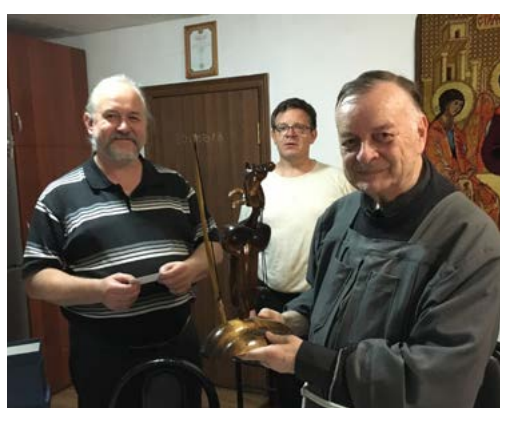
The friars with the Minister General / the friars of the mission