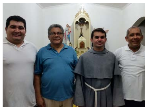
The communities of Bom Jardim and São Luis