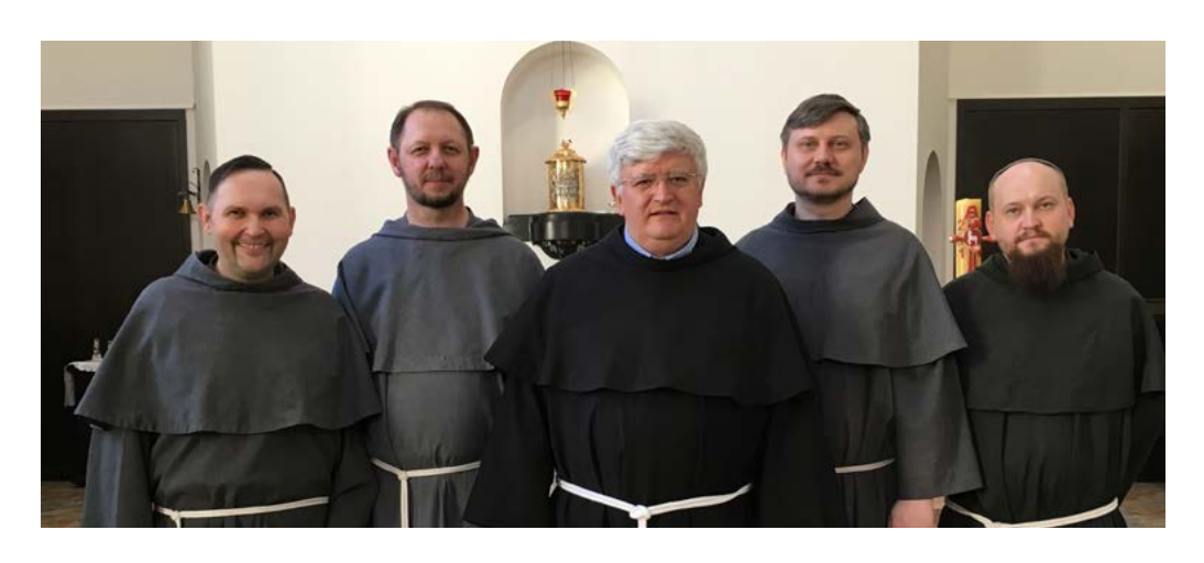
The Definitory with the Minister General

The second part of the chapter will take place September 10-13, 2018, in St. Petersburg.