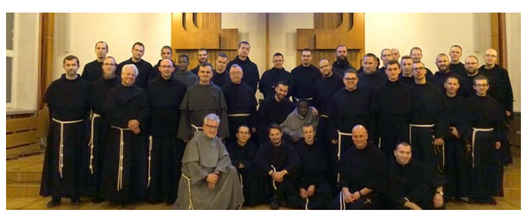
The post-novitiate community in Łódź