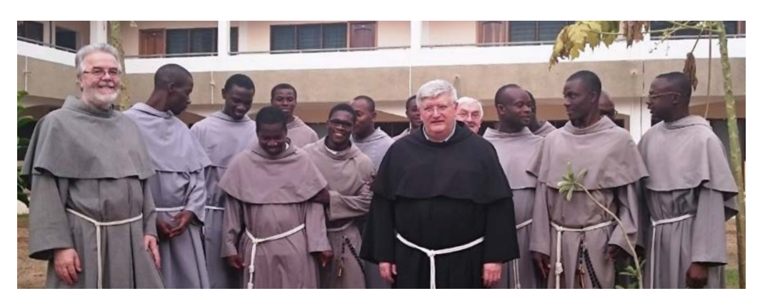
The Minister General with the friars in Ghana