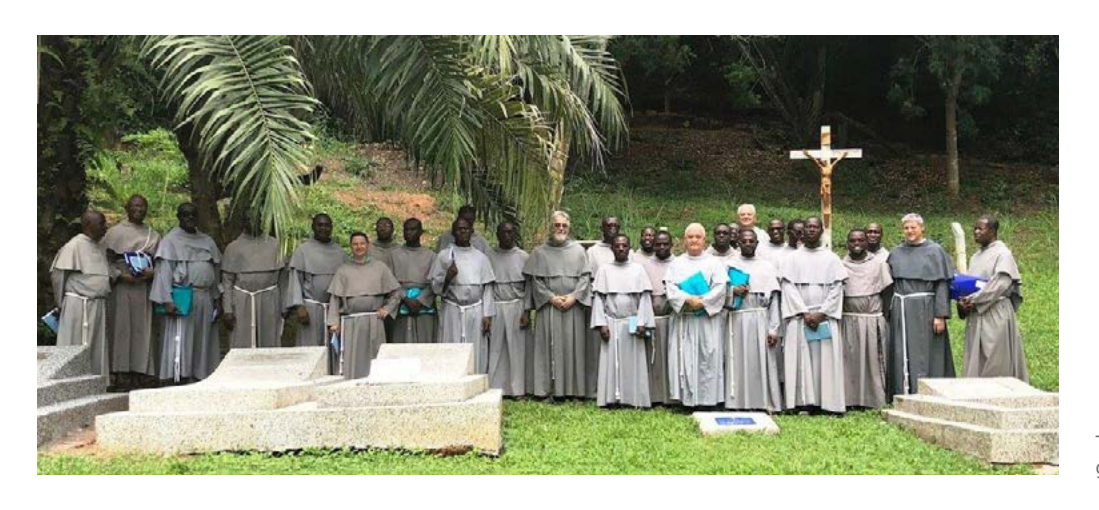
The Capitulars pray over the graves of their confrères