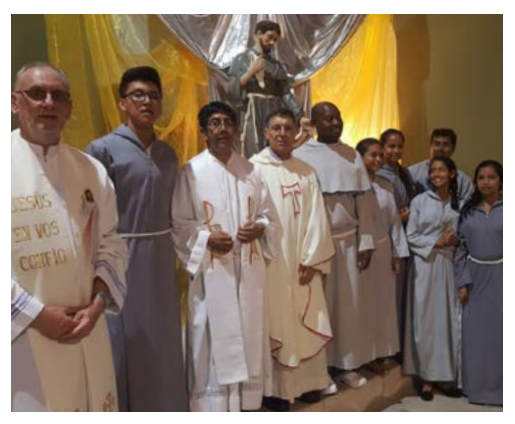
The communities of Tulcán and Santo Domingo de los Colorados