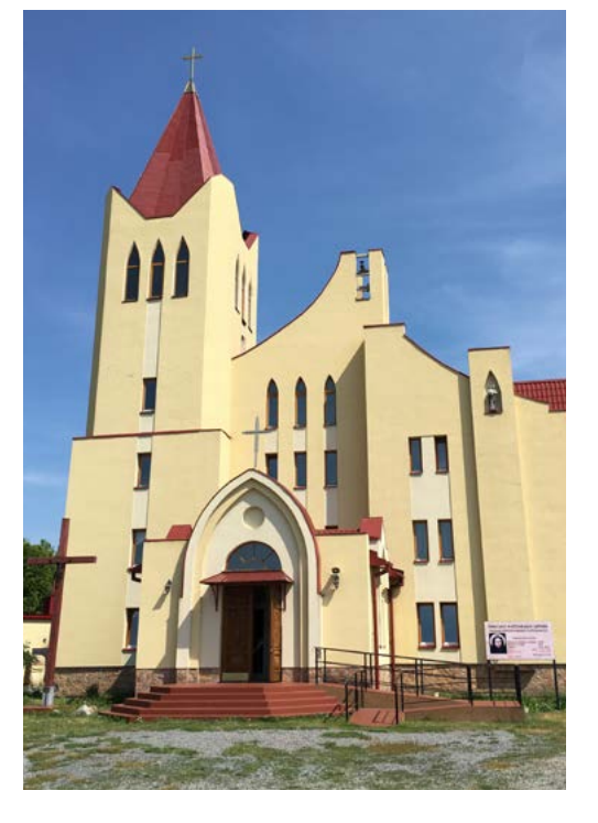
Bilshivtsi { Більшівці } Boryspil {Бориспіль} Lviv {Львів}